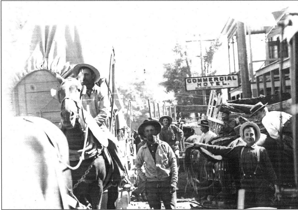
Thousands of people flood Main Street in Angels Camp for the first Jumping Frog Jubilee.

“We attended the most picturesque and colorful event in California the other day when we visited the notorious Camp Angels,” the letter reads. “Most of the people were dressed in real western clothes and it took one back in reality to the ‘Days of Old and the Days of Gold,’ and they are again days of gold here in California because gold mining is on the boom everywhere. California is truly the Golden State—golden poppies everywhere now—and gold mines everywhere—all