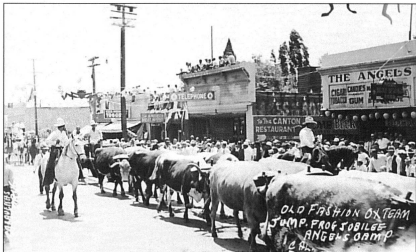
An ox team moves down Main Street during the Jumping Frog Jubilee in the 1930s.

In 1944, the jubilee featured the special showing of the Warner Bros. film “The Adventures of Mark Twain” and the dedication of a life-size statue of the famous humorist.