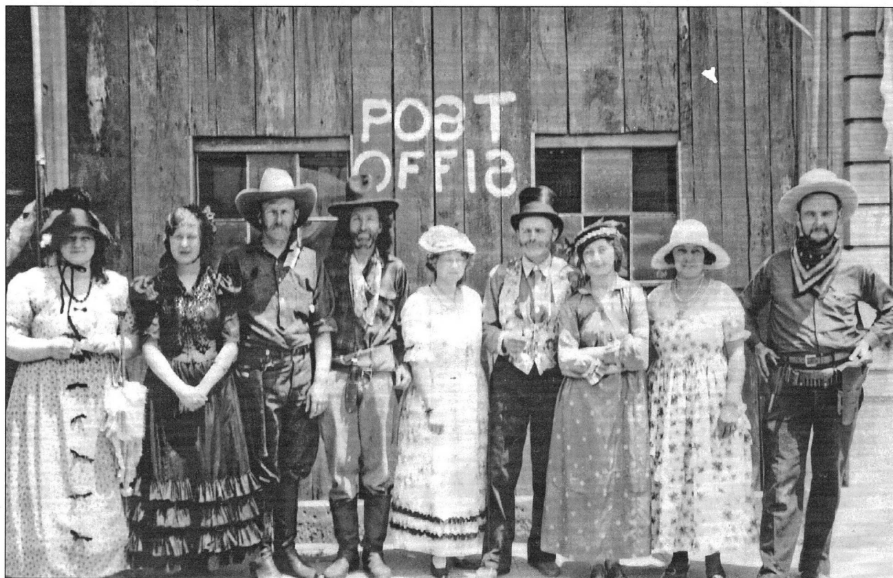
A group gathers for a photo at the Jumping Frog Jubilee in 1928.

A parade of old-time vehicles had been a prominent feature of the Jumping Frog Jubilee since the beginning. In order to conserve gasoline and