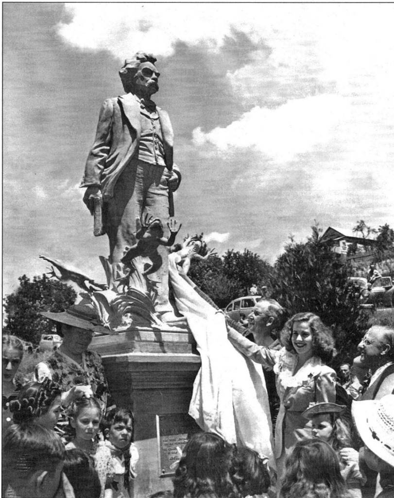
A statue of Mark Twain is dedicated in Utica Park in Angels Camp during the Jumping Frog Jubilee in May of 1944.