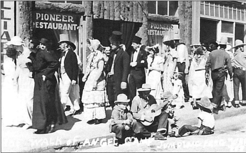
This postcard shows a sidewalk scene during the Jumping Frog Jubilee in the 1930s.

tires, the event’s organizers came up with a creative way to address the transportation issue.